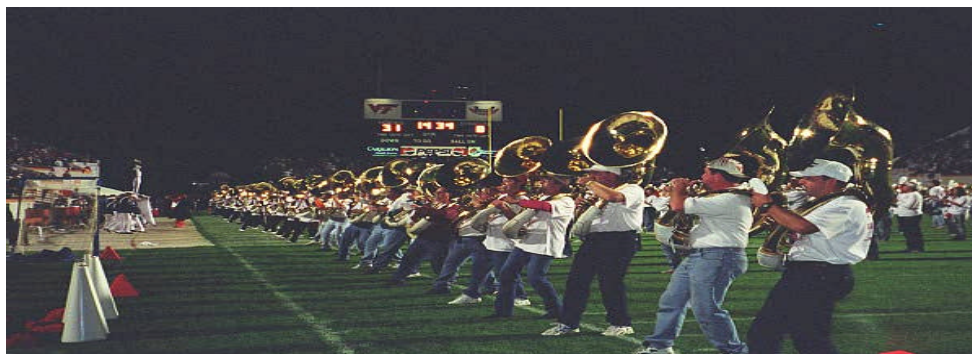
The Hokie bird Directs MV Tubas of Past and Present in the Hokie Pokie...The Premier of the "20 for the 25th" Tubas

The days events were not only spectacular, they were special. Honored guests at our Banquet/Sophisticated Tailgate were