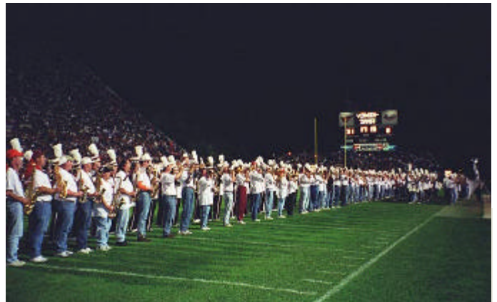
The Superman Fanfare and the double state of Virginia as never seen before

Ending Checking Account Balance: $ 3,516.35