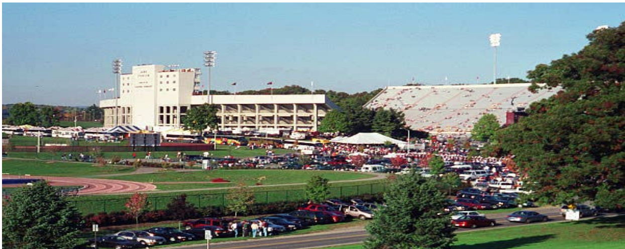
What a beautiful day in Blacksburg! Homecoming 1999, Lane Stadium as seen from the MV practice field on game day.

The Marching Virginians Alumni Association “Where the “Spirit of Tech’s” past, partners with the “Spirit of Tech’s” present, to support “The Spirit of Tech’s” future.